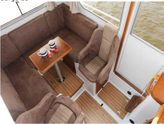
Sargo 25 saloon seating