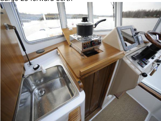
Sargo 25 galley facilities