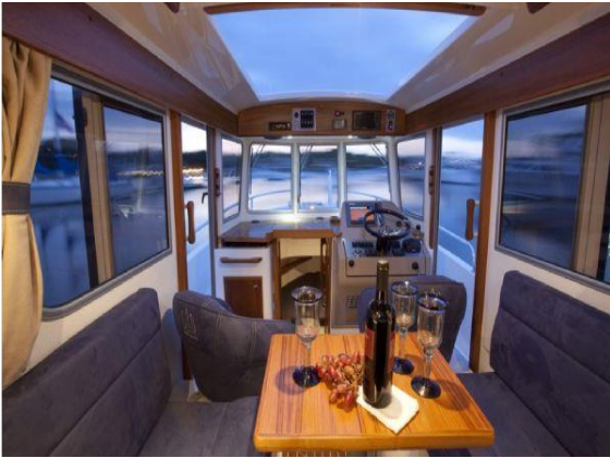
Sargo 25 Saloon