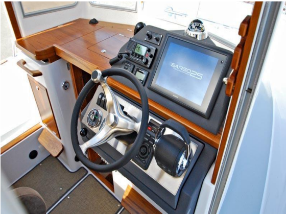
Sargo 25 helm