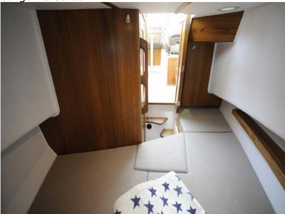
Sargo 25 forward berth