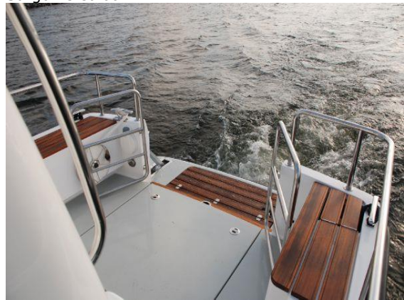
Sargo 25 aft deck