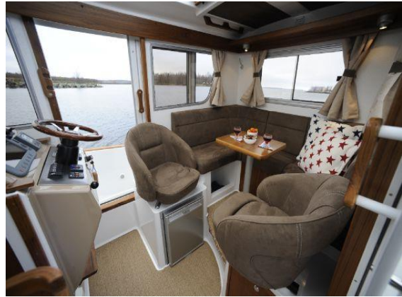
Sargo 25 saloon