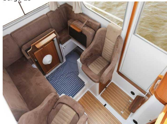
Sargo 25 under saloon double berth